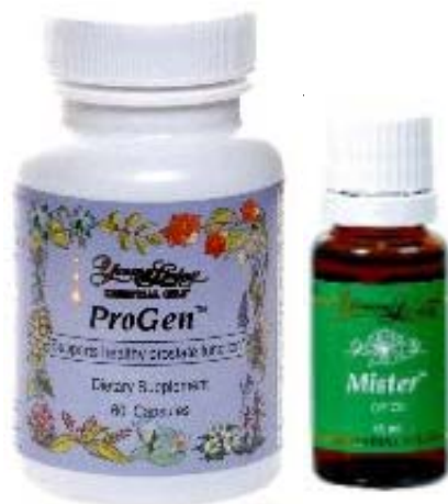
Made for men's health: ProGen™ and Mister™

Andropause has received little attention because it sneaks up on its victims. Unlike a woman, whose sex hormones drop abruptly during perimenopause, a healthy man's total plasma testosterone level declines very slowly with age. 3